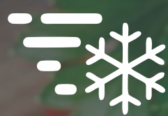
Plate freezing or blast freezing to bring down the core temperature to less than minus 18 degree Celsius

pH value is lowered to below 6 to achieve fresh tenderness in the meat